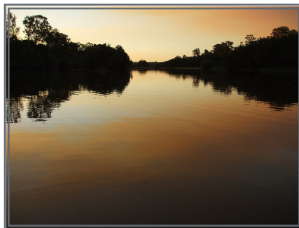
Burnett River Sunset

That's all for now in our waterways for the cooler months, stay tuned for more up dates.