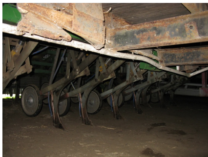
A planter being modified to no till by a South Burnett grower

The workshop was delivered as part of the Better Catchments program, which aims at providing training and assistance