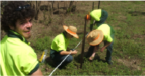
The National Green Jobs Corps team gets hands on pulling out weeds along the fenceline

The start of nesting season for the White-throated Snapping Turtle was starkly different this year as the first nest protection areas were established on three vital nesting areas along the Burnett River. The Turtle ( Elseya albagula ), a threatened freshwater turtle, native only to the Burnett, Fitzroy and Mary River catchments, is facing extinction if no action is taken to decrease the threats to their eggs laid between April and July, threats such as wild dog and goanna predation, as well as cattle trampling. So far the research has shown that 99% of nests in the wild are destroyed, leaving very few young to