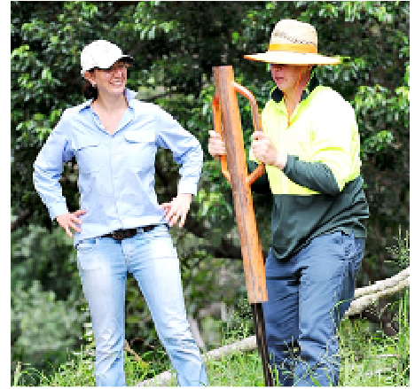
Much hard work was put in to erecting each of the nesting areas on the Burnett River

program in July this year, but we at BCCA are pleased to hear that another team will be replacing them and continuing to monitor and maintain the sites for the next 5 months, including the hatching time. We are waiting to confirm the details but are very pleased to be able to work with the young people of our region.